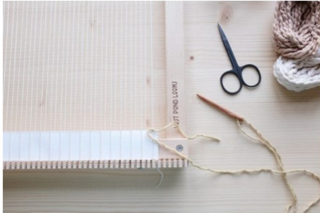
Tabby weaving Step 1