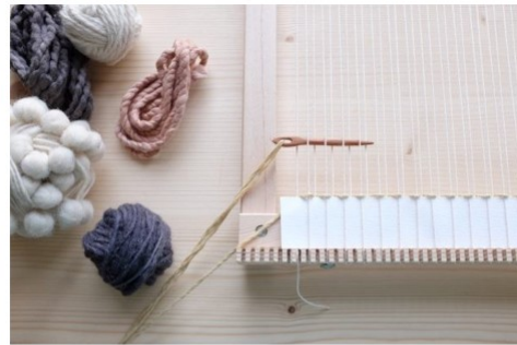
Tabby weaving Step 3