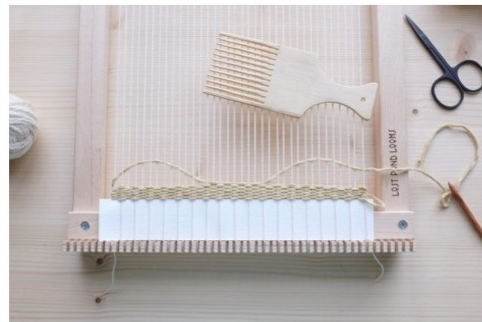
Tabby weaving Step 4