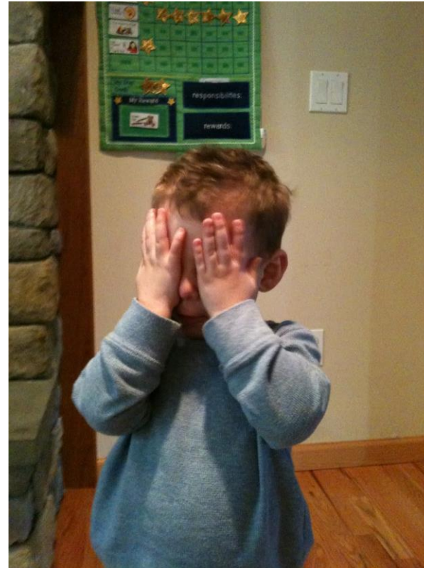
By counting, one mississippi, two mississippi ...