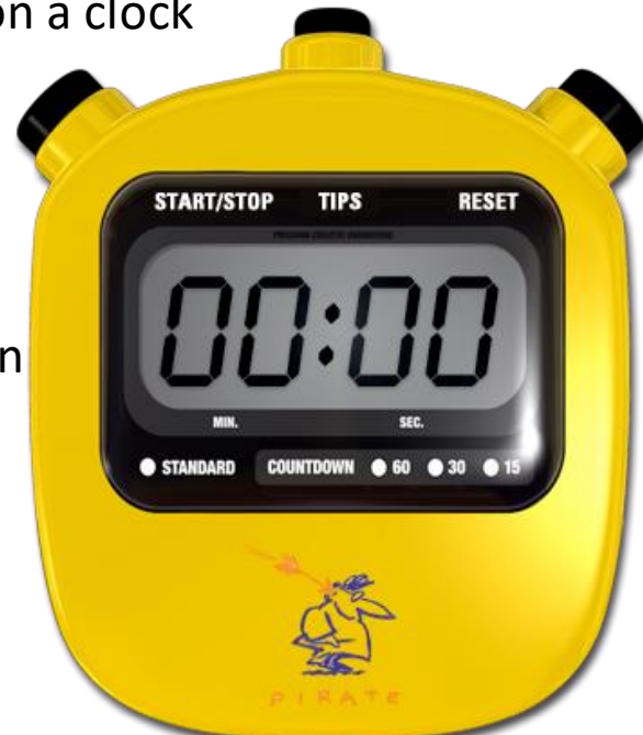
Using a stopwatch