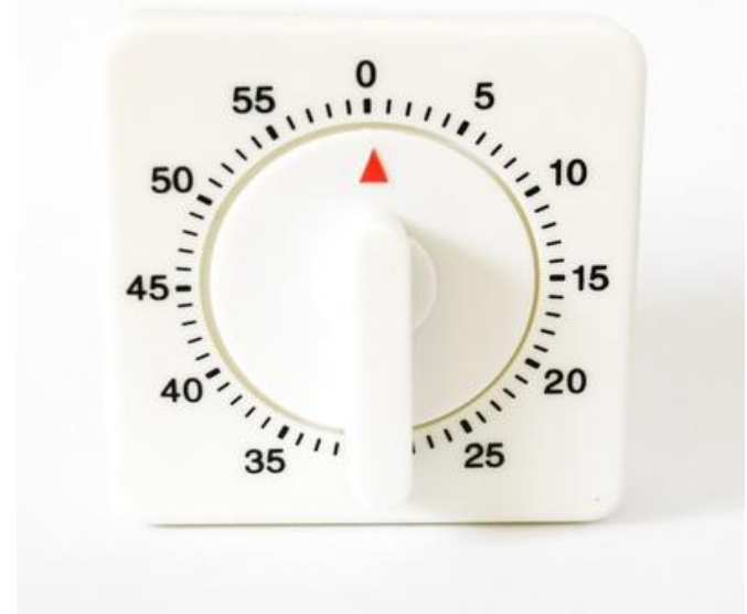
Using a kitchen timer