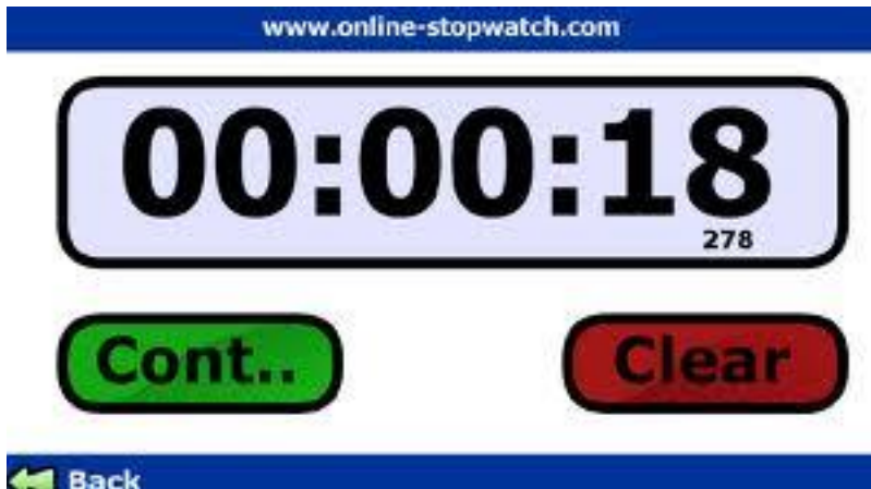
Using an online timer