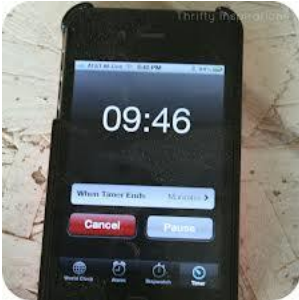
Using a timer or stopwatch on a phone