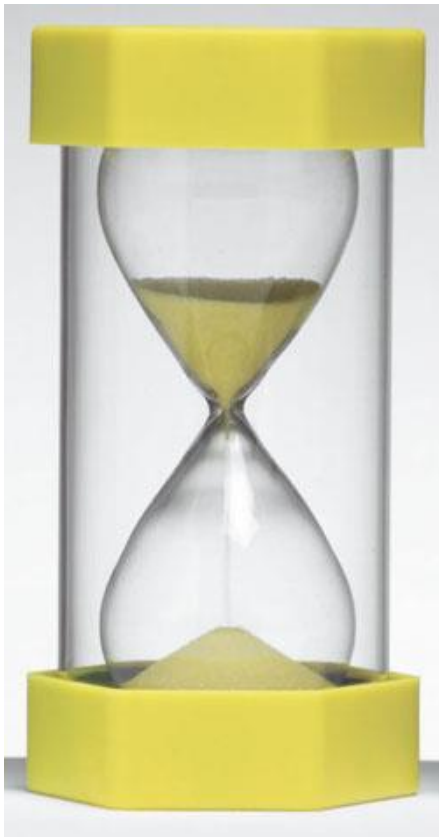
One minute sand timer