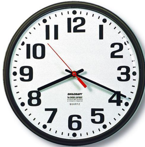
Watching the second hand on a clock