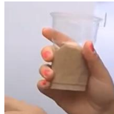
Half full cup