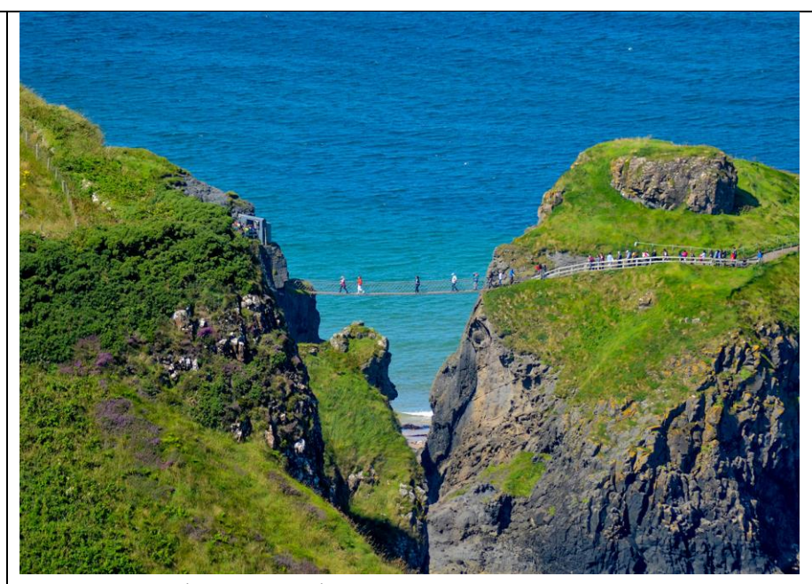
Carrick-a-Rede rope bridge